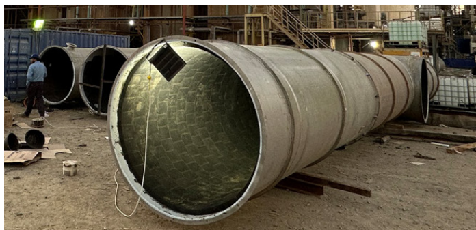
1. Project Laydown Area - PENNGUARD Block was applied to each section of a flue while laying horizontal on a ground level

Heavy oil with high SO 3 content fuels the paper mill's boiler. Under normal operation, a wet flue gas desulfurization (WFGD) scrubber with no reheat drops the gas temperature down to 70°C before it enters the flues at a velocity of 15 m/sec. When the WFGD unexpectedly goes off-line, the gas temperature can spike to 265°C before it is quenched to 130°C. The mill needed to minimize downtime while upgrading the flues to handle the wide temperature variability and corrosive gas condensate.