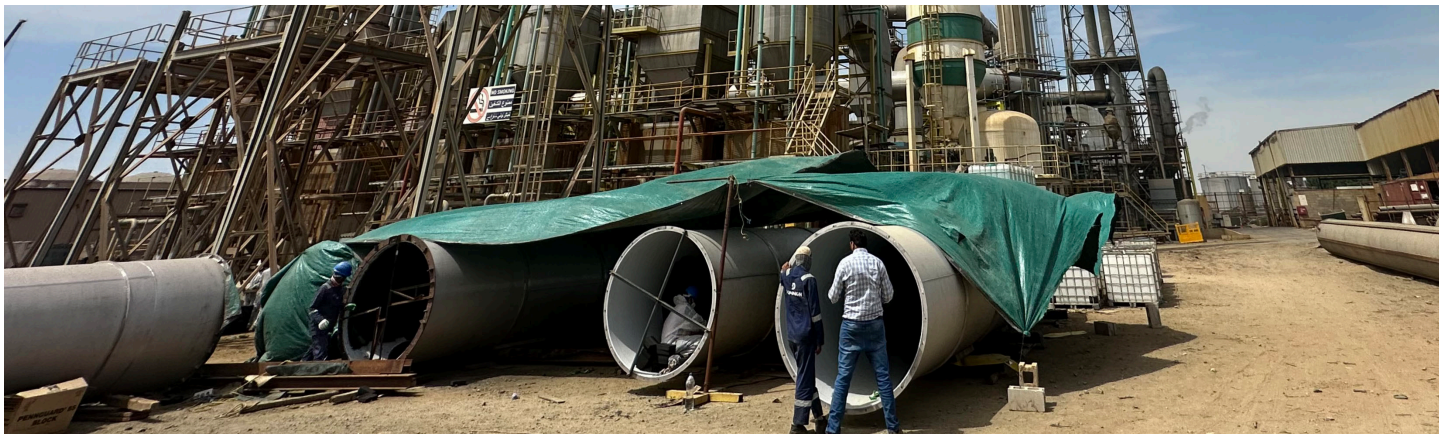
8. Job Site Perspective - The flue sections being coated in the laydown area were disassembled from the tower structure in the forefront

Dominion applied the PENNGUARD HP Epoxy Primer over the prepared substrate with a roller. Using a roller to apply the primer allowed the installer to control the film thickness, avoid wasting material, and protect the fresh coating from marring. Applying the primer with spray equipment inside the small, tubular cans would have introduced avoidable challenges to a quality installation.