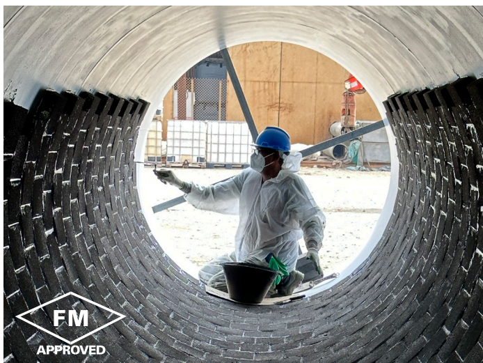
3. Small Diameter Flues - PENNGUARD Block Lining System being applied in a 1.7 m (5'7") diameter flue

Each stage of the project—from material selection, to construction planning, to execution—played a critical role in its success.