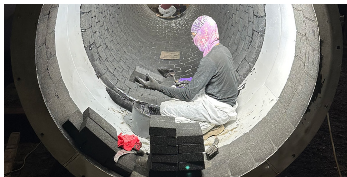
2. All day (24-Hour) Shifts - A flue being worked on at night using proper safety precautions

The project's success hinged upon an adaptable lining system and collaborative implementation planning. The mill chose ErgonArmor's 51 mm thick PENNGUARD™ 55 Block Lining System, a closed-cell, foamed borosilicate glass block lining with a global reputation for long-term corrosion protection in fossil fuel combustion plants. The lining supplier, ErgonArmor, and installer, Dominion Arabia, developed an execution plan to deliver the project quickly, safely and with minimal downtime.